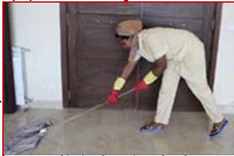
An Ethiopian domestic worker cleans a household in Lebanon. (TIP, pg. 27)

For instance, it is increasingly understood that there is a temporal limit to the immunity enjoyed by diplomats and their family members. The Vienna Convention on Diplomatic Relations provides that, after a diplomat leaves his or her position, the diplomat enjoys a limited form of immunity that extends only to the diplomat's 'official acts' while he or she was accredited.