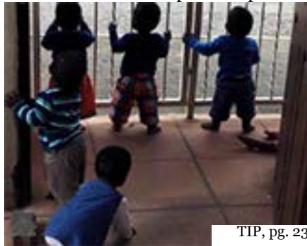
TIP, pg. 23

Institutional complicity can even extend to the practice of recruiting children for the facility. 'Child finders' travel to local villages or communities — often those affected by war, natural disaster, poverty, or societal discrimination—and promise parents